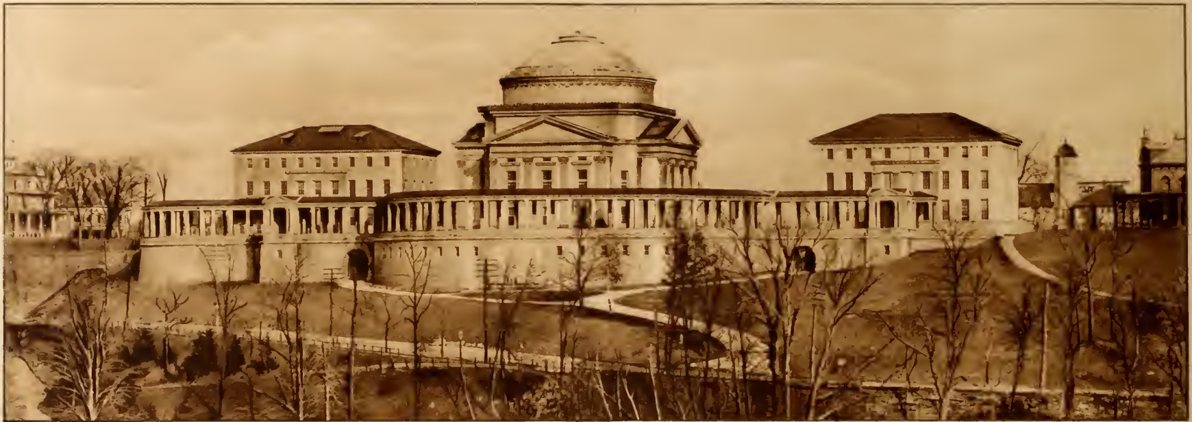
NEW YORK UNIVERSITY BUILDINGS, on University Heights, showing the Hall of Fame, where the greatest Americans are honored. An imposing group of buildings.